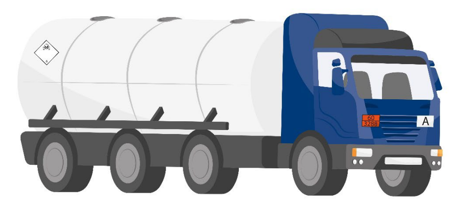
Example of labeling based on UN 3288.